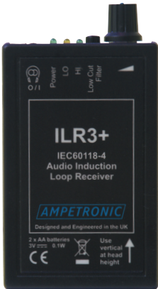
ILR3+ front view

The loop checking system comes with an easy to follow procedure for checking any loop system.