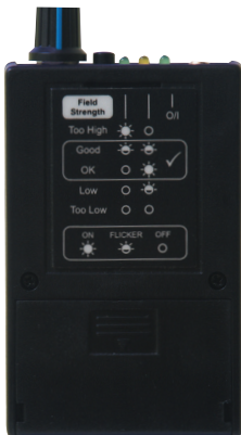
ILR3+ rear view