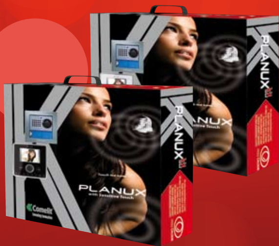
Single family kit