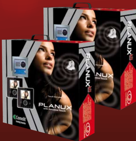
Two family kit with intercom